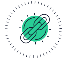
Build cross-chain interoperability protocols