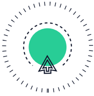
Expand performance and capacity to handle the demands for greater scale and performance