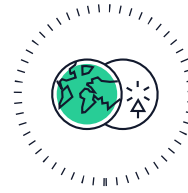
Build a decentralized autonomous community