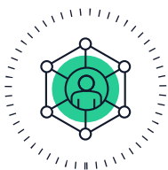
Decentralized Identity Management Decentralized Identifiers (DIDs)

Regarding Web3.0, we will intensely promote the process of decentralization and build a community of shared interests that benefits both users and protocols. We believe that the Internet of the future should be user-created, user-owned, user-controlled, and protocol-distributed. Thus, the blockchain as the basis, we are actively exploring and implementing the following areas: