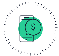
KCS GoDAO Benefits Sharing Program

We believe that under the professional management and promotion of the foundation's team, the KCS ecosystem will be further improved;