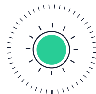
Construction of metaverse network platform, including work, social networking, games, etc.