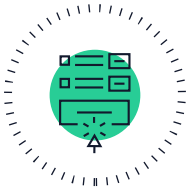
Build basic toolchain for the blockchain

The KCC chain was a blockchain project initiated and developed by the core members of the KCS and KuCoin development community. The emergence of the KCC chain started a new chapter in the development of the KCS ecosystem by bringing a lively scene of decentralized applications to the chain. KCC will focus on the following areas: