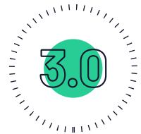
Web 3.0 ecosystem

In the above four areas, we will focus on the following plans: