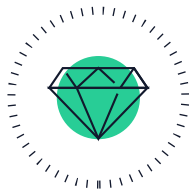
KCS GoDAO Listing Program