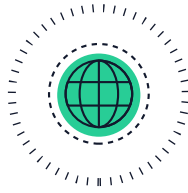
Build a global open developer platform