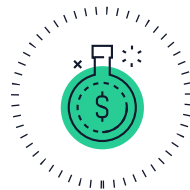
KCS GoDAO Investment Plan