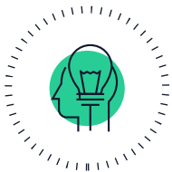
KCS GoDAO Analyst Program

In the above four areas, we will focus on the following plans: